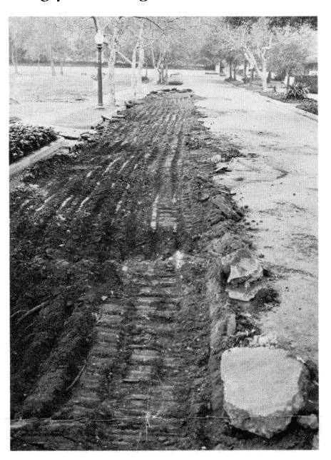
ABOVE—The beginning of the end for Mentoria Court.

trance with its large and spacious lounge similar to the one on the north side. Continuing east you come to the food preparing and serving area where hungry students get their meals. Behind