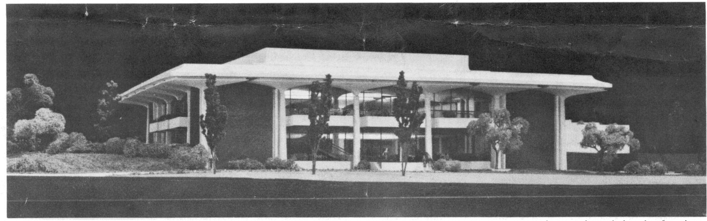
DINING HALL MODEL-Here is a close-up shot of scale model showing what the new Dining Hall will look like when completed. It will easily