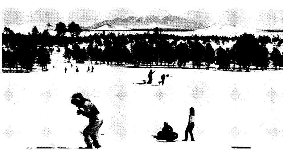
FANTASTIC BEAUTY—Covering the ground like a blanket of white cotton, snow provided fun and beauty for children and adults.